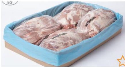
☆ Pork Collar. Price per MT $3500