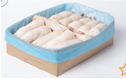
Front Feet. Price per MT $2100