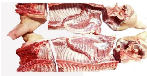
Pork 6 way cut. Price per MT $3000