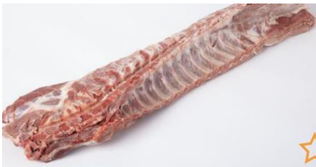
Pork Loin. Price per MT $4000 Blns. Rind less