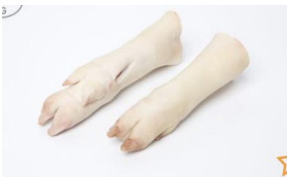
☆ Hind Feet. Price per MT $2200