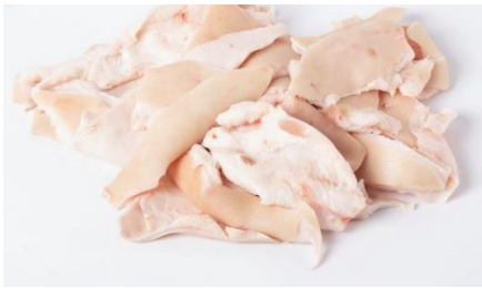
Pork Rind. Price per MT $3700