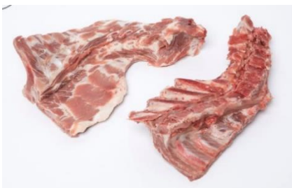
Neck Bone Price per MT $2100