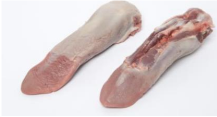
Pork Tongue. Price per MT $2700