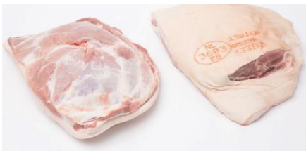
Pork Shoulder. Price per MT $4500