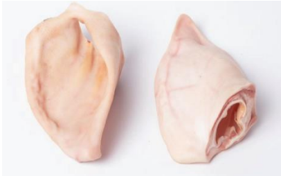
Ears. Price per MT $ 2350