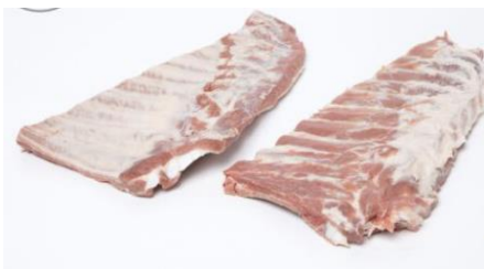
Spare Ribs. Price per MT $3300